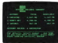
It can manage your entire stock portfolio with programs like Dow Jones Investor's Workshop™ and Charles Schwab and Company's The Equalizer™. It can even show you what's going on in your bank account.*