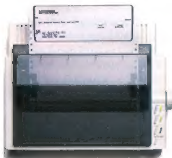
With our Scribe™ color graphics printer, you can automatically print out your own checks — not to mention reports, papers, almost anything. Except money.

After the Apple II writes your checks, it can call your bank with the help of your telephone and an Apple modem. And faster than a teller can say "Next window,