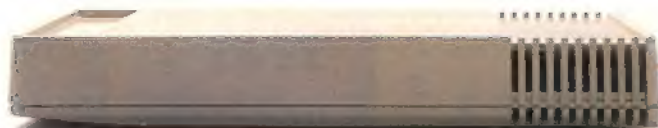
This is an Apple modem. Not much to look at, we admit, but it does let you pay bills and trade stocks by phone. It also connects your Apple II to a wealth of information services, like THE SOURCE™ and CompuServe®.

using an Apple modem, you'll gain instant access to financial news sources like The Wall Street Journal , Barrons , and the Dow Jones News/Retrieval® service. Find out what they've been saying on Wall Street Week . And in most cases, get up to the minute price quotes on over six thousand stocks, options, and other securities.