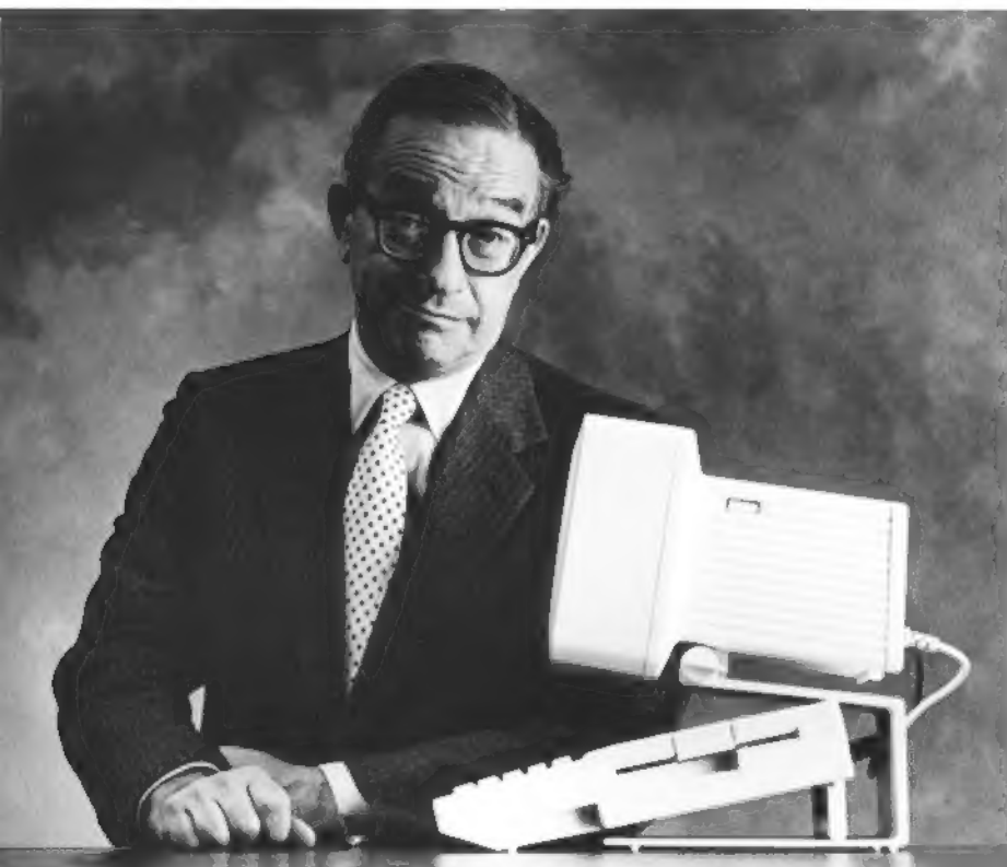
Alan Greenspan, Famous Economic Advisor

"The other day, a prominent politician in the executive branch of our government phoned me up.